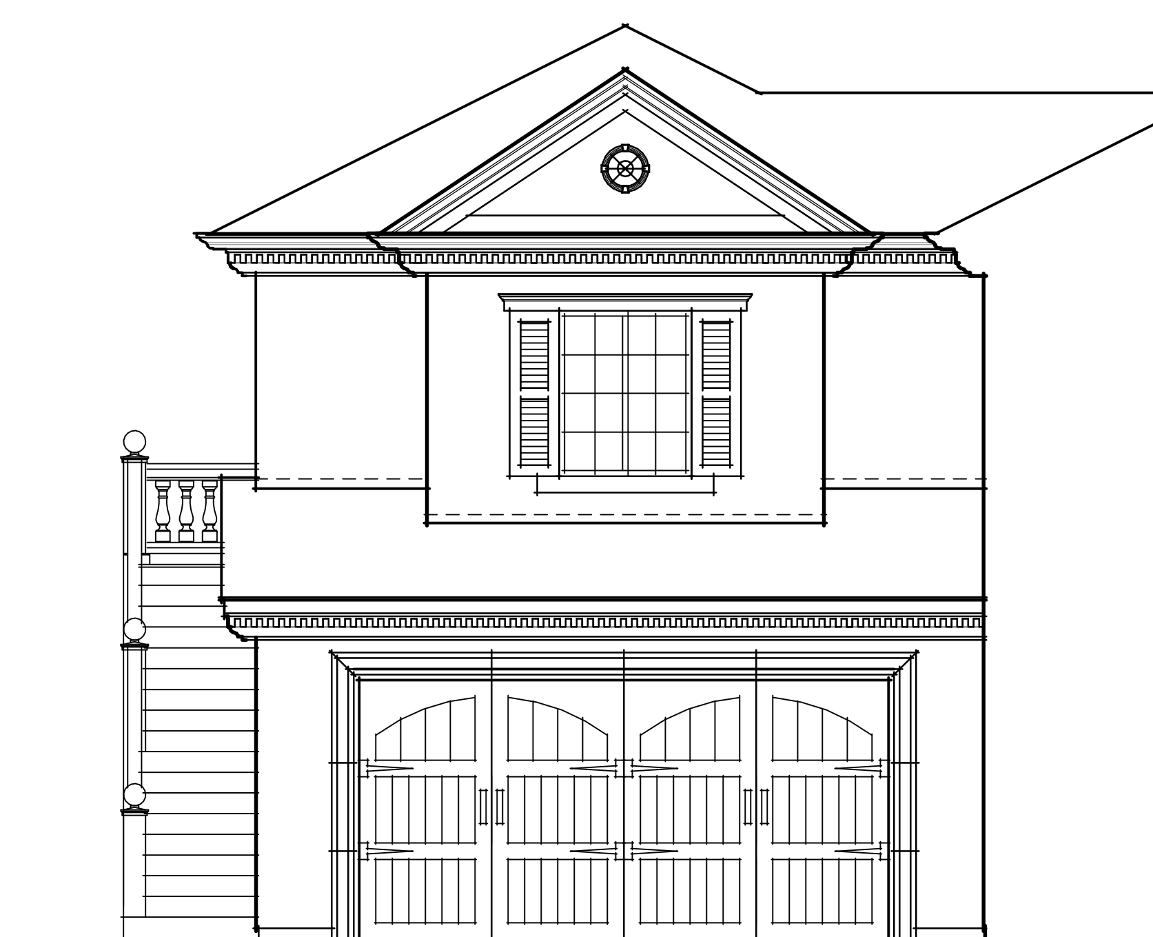
OPTIONAL FRONT ELEV 'A' CARRIAGE UNIT