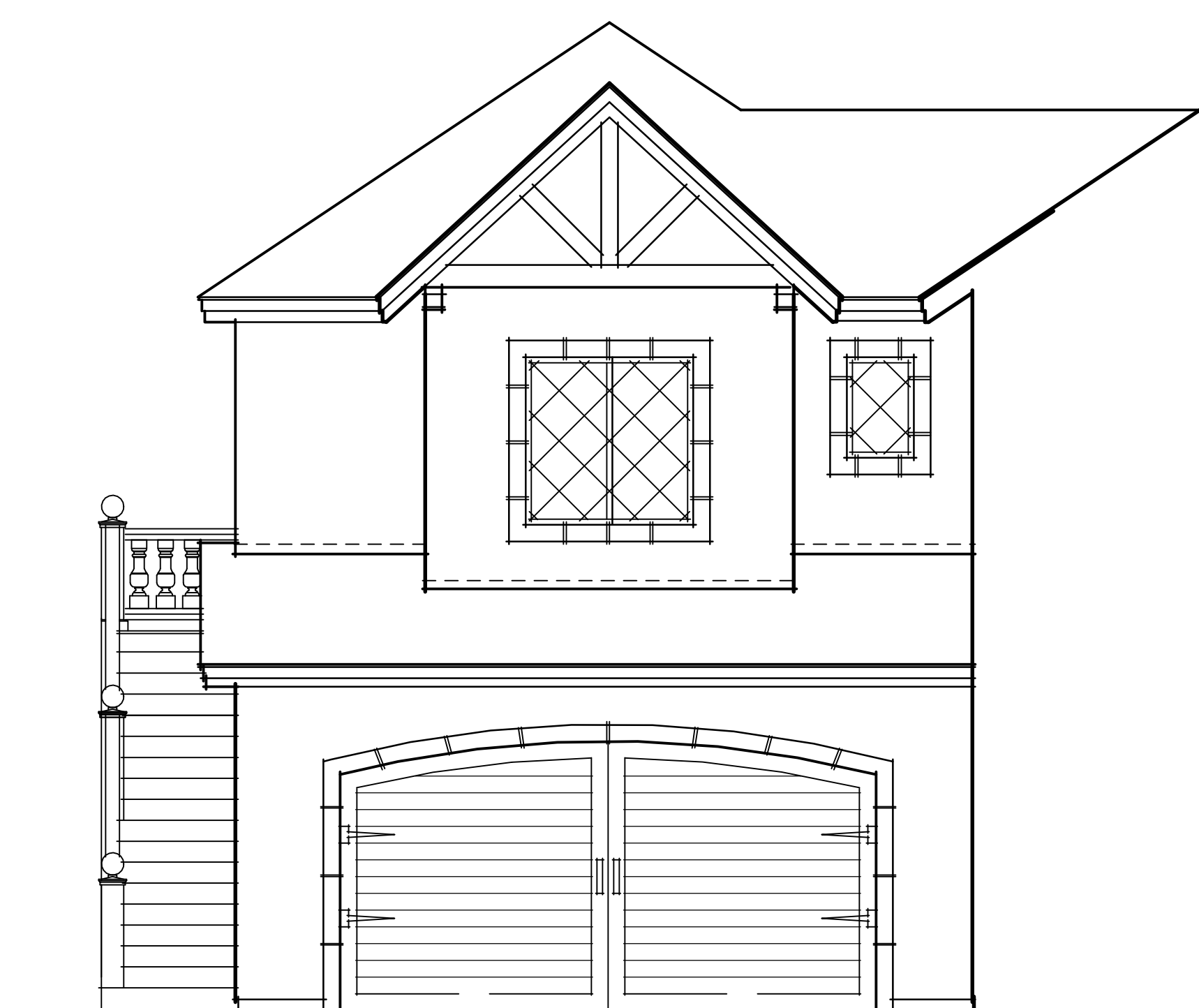
OPTIONAL FRONT ELEV 'B' CARRIAGE UNIT