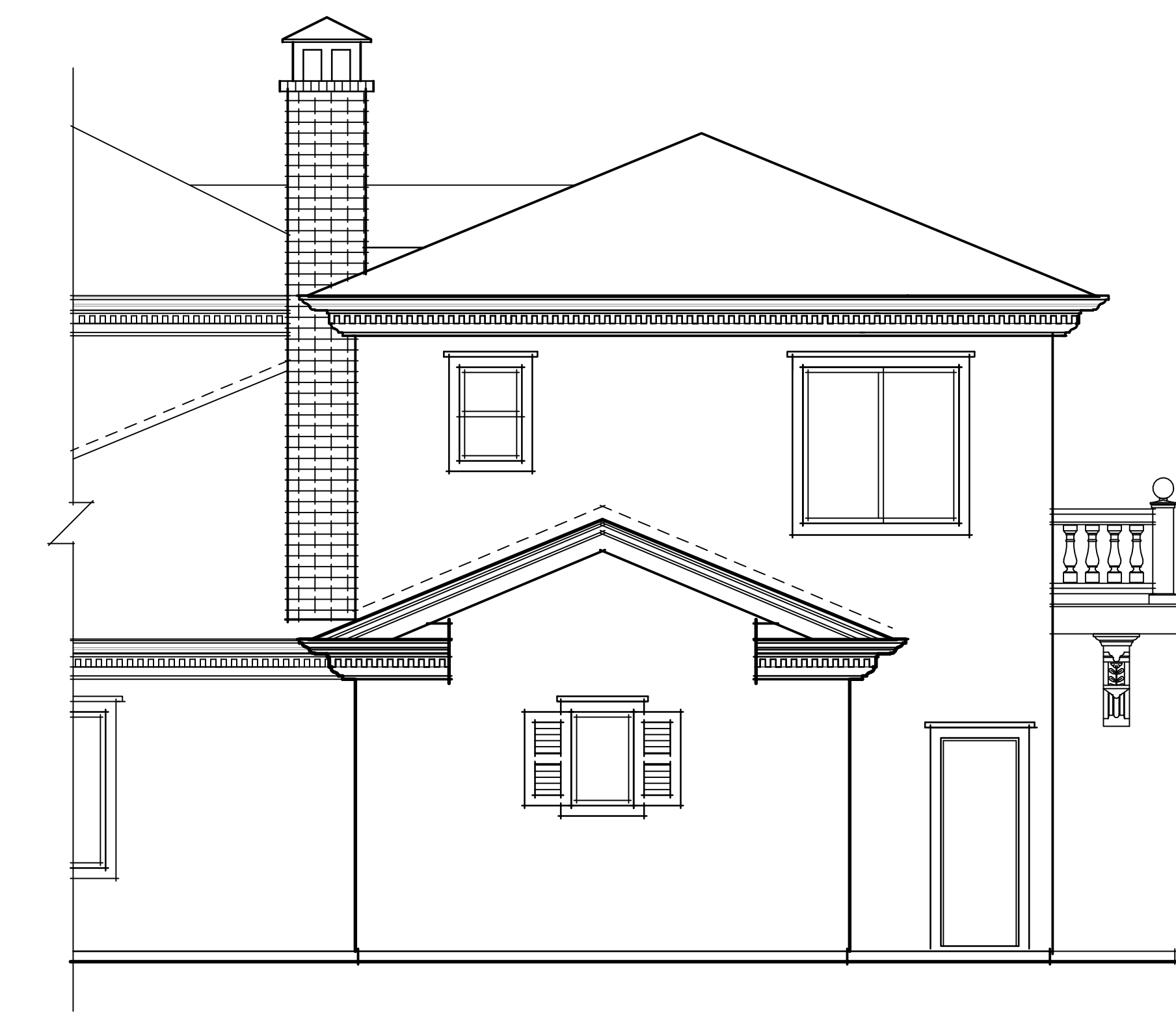
OPTIONAL REAR ELEV 'A' CARRIAGE UNIT