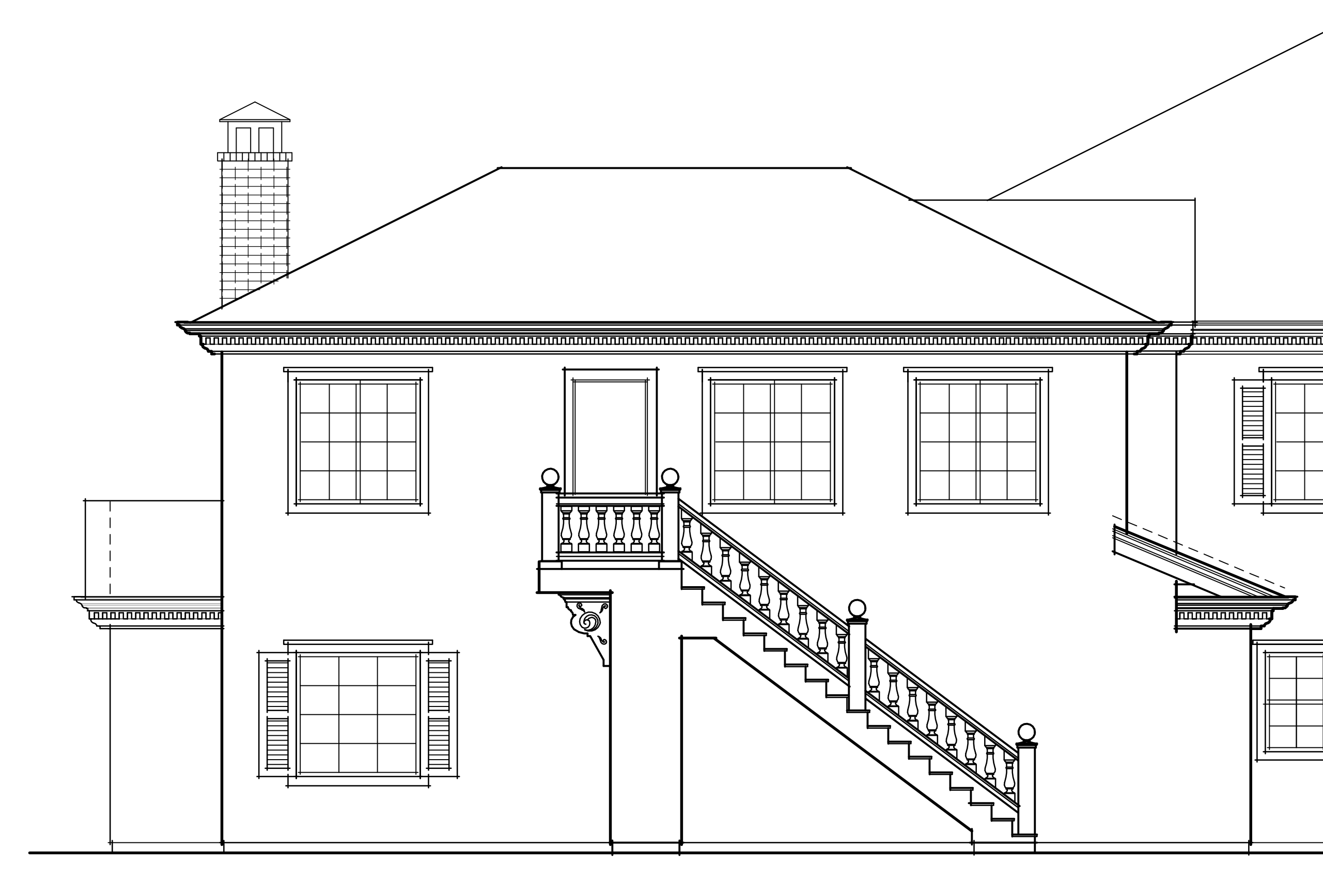
OPTIONAL LEFT ELEV 'A' CARRIAGE UNIT