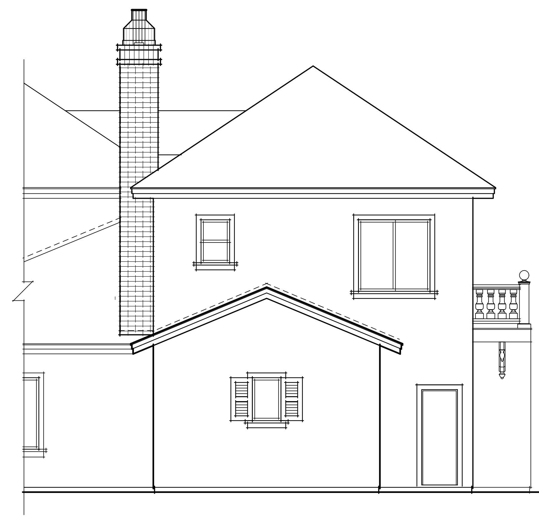
OPTIONAL REAR ELEV 'B' CARRIAGE UNIT